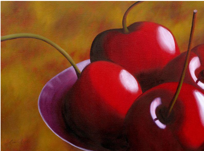
An extreme close up