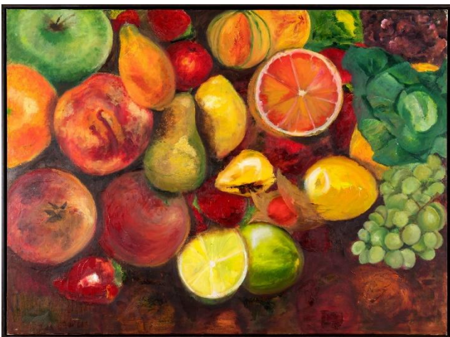
A jumble of fruits and vegetables - some cut open