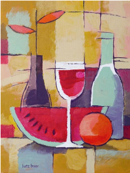
Stylised – looking for shapes