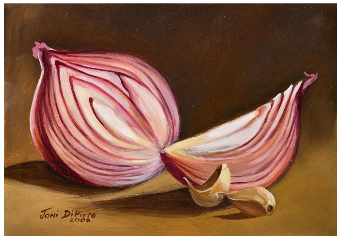
Focusing in on the detail

Arrange three or more items together. Using a sharp pencil see if you can draw this still life arrangement. Colouring in is optional, you may want to keep your picture as a pencil sketch.