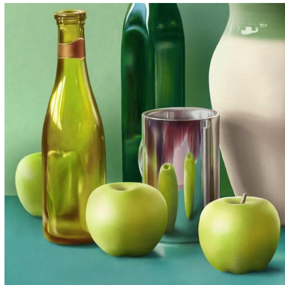
Looking for reflections